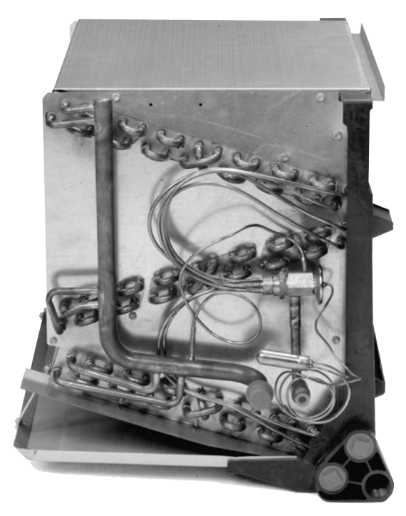
NOTE: Shown with Horizontal Drip Shield. (Requires RXHH- Horizontal Adapter Kit.)